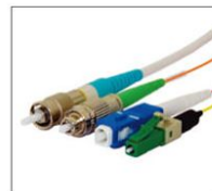
Available for Lynx-Custom Fit™ Splice-On Connector