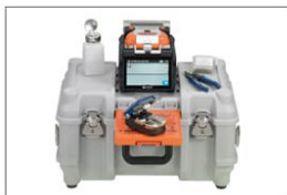
Carrying case with worktable CC-72

Items listed in Basic Accessories are always included with the splicer body. Overall kit content may vary regionally. Please check with your local authorised reseller to confirm kit content in your region.