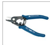
Jacket remover JR-M03